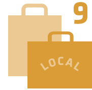
Local business precincts

Encouraging shoppers back to their local, earthquake-affected business precincts was the purpose of these funds. Granted to the Canterbury Business Recovery Trust - which has since closed - in 2013 it benefitted Sumner, Edgware, Rangiora, Papanui, New Regent Street, Lyttelton, Kaiapoi, New Brighton and Oxford. Activities like community engagement, marketing and supporting community events, all helped to bring people back into these shopping areas.